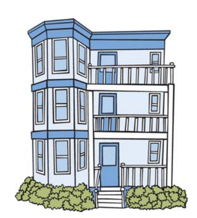
built before 1978

Lead paint and dust from lead paint are the major sources of lead exposure in children. In 1978, lead was banned in house paint. Most homes built before that year contain lead. Children and adults can be exposed to lead during renovation projects or whenever lead paint is improperly sanded, scraped or burned.